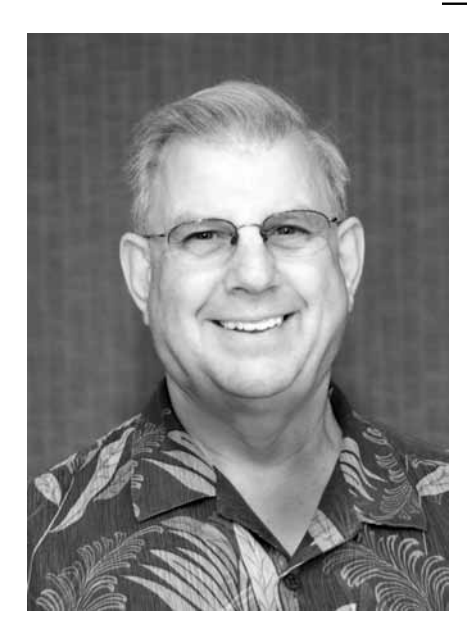
What's New in San Diego's Finest Neighborhood?

We treasure those things that do not change such as: our weather, our convenient entrance to any freeway. our fabulous library, our active Park and Recreation opportunities, our top notch schools, our Food Pantry which includes our Serra Mesa Garden and Orchard, our Serra Mesa Planning Department, and last but not least, those hard working board members of the Serra Mesa Community Council. While talking with many Serra Mesa residents, I am pleased to say that a NEW line of communication has opened with Nextdoor.com. My feeling is that this is one of the most exciting things to come down the pike in a long time. While it is a social media opportunity, it is monitored by our local SDPD and is tailored to only be visible to your neighbors and allows you to speak what is on your mind. For instance, one of our citizens mentioned that there was no actual sidewalk on Mission Village Drive from Ronda Avenue down to