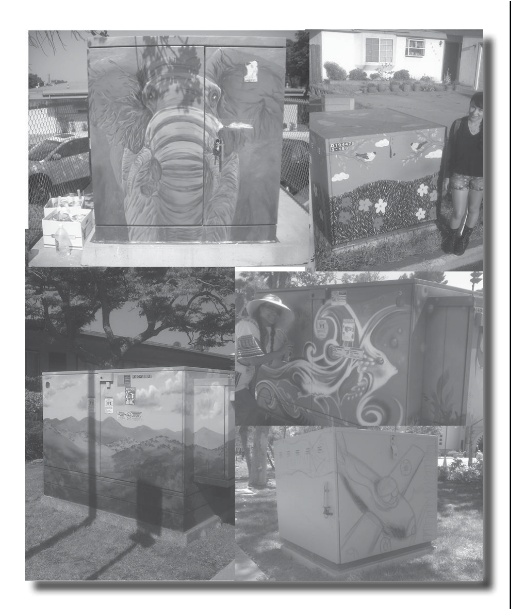
Have you seen these? for more details see pages 16-18