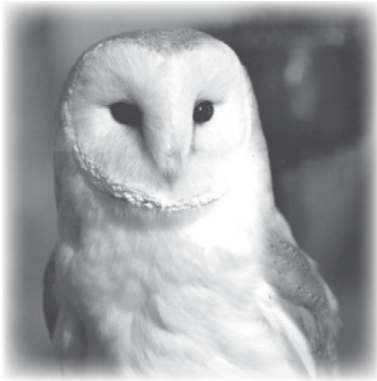
Young Barn Owl