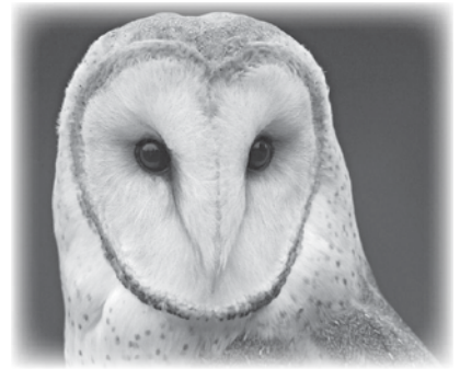
Female Barn Owl

There are barn owls in the nest box FRC had erected east of Taft a couple of years back! We can't say when they came, because they hunt and call only at night. Working too late in the garden in July, Glenn Torbett heard the rasping call of begging owlets. We crept toward the sound and were rewarded by the sight of an adult as it silently sailed onto the box. The greedy owlets squawked even louder. In a week they fledged (left the nest), but continued to demand food as hunting skills developed. A family of owls will consume about 1000 mice, rats, and gophers in one 3-month nesting cycle, and may nest several times in a good year like this. Nesting season starts in December, but owlets are still calling in the canyon west of Pasternack Place.