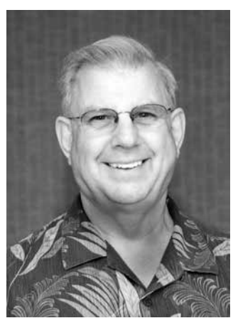
Who will you vote for?

I always enjoy the New Year where things are new, everyone has just celebrated the holidays with family. We all have resolutions to help us make the world a better place and ourselves while we are at it. I personally would like to wish you and yours the best year ever. I hope this year brings you much happiness and prosperity. I wish the best health to you and yours. We live in the greatest Country, in the most progressive State, and a Great City with the best weather in the world. Yes, we have problems but now is the time to review our elected officials and make sure that the ones we select are looking out for us. Is it not easier to choose when we take the time to consider, research, and interact with our officials?