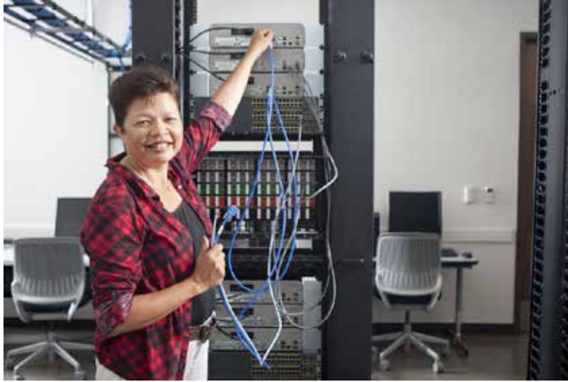
San Diego Continuing Education's Cisco Learning Lab

San Diego residents in search of pandemic resilient jobs can enroll in San Diego Continuing Education's (SDCE's) ICOM Academy (Interactive Competency-based Online Micro-credentialing Academy) for essential information technology skills. Noncredit classes are available at no cost, and due to the pandemic are taught fully online.