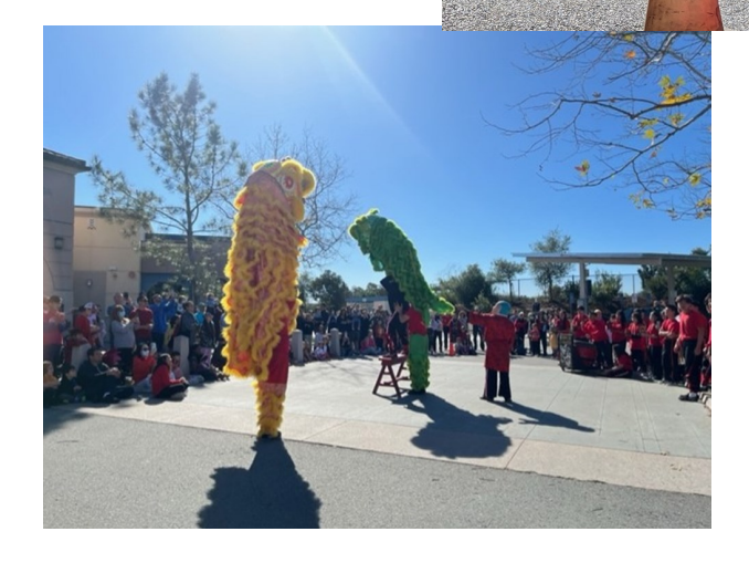
More on page 11

Serra Mesa - Kearny Mesa Library Community Room, 9005 Aero Drive