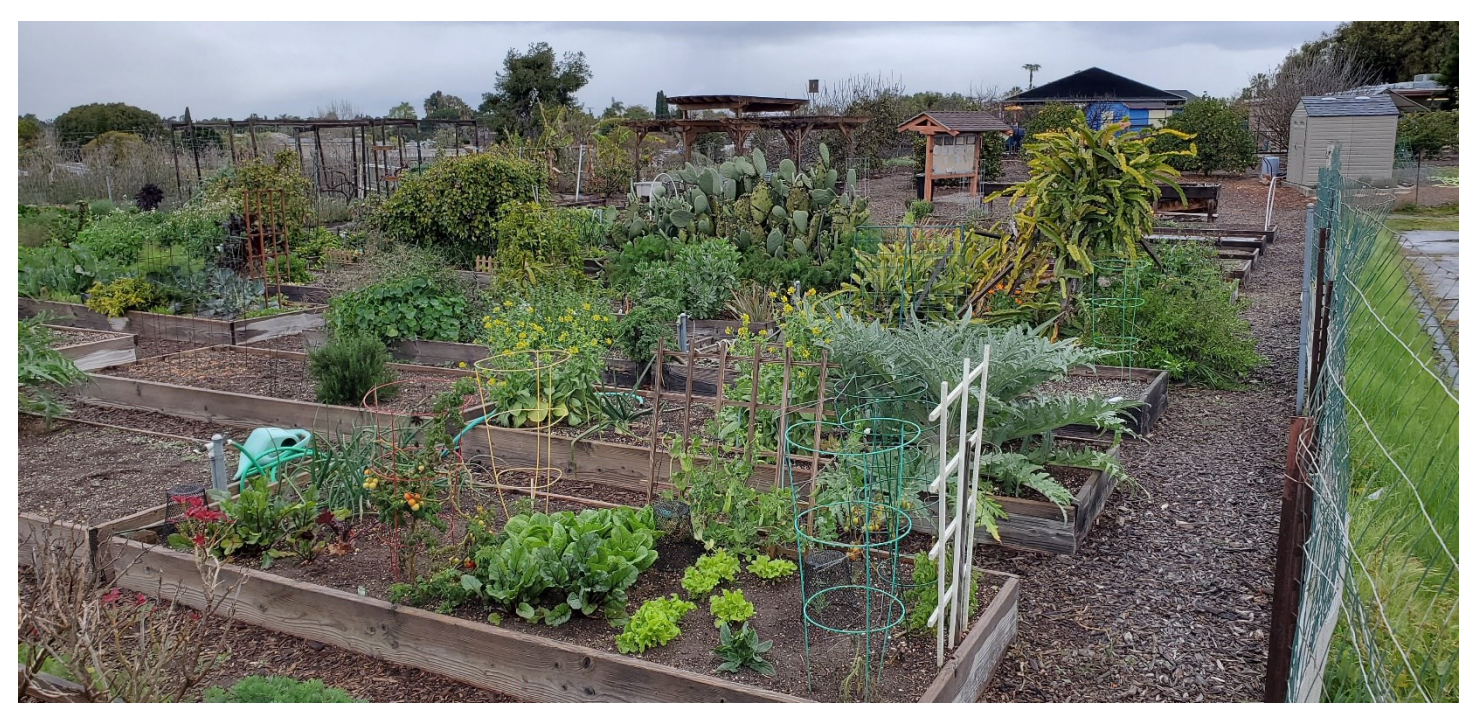
Photo taken late February 2023. Shows a fenced, well-maintained community garden — individual plots, kiosk, covered areas, and storage unit. Looking at photo: compost area to the right of storage unit and orchard behind structures.

Check out the garden at the back of 2650 Melbourne Drive (across from Juarez Elementary School) or email <a href="mailto:info@smcgo.org">info@smcgo.org</a> for information on renting one of the plots, as available.