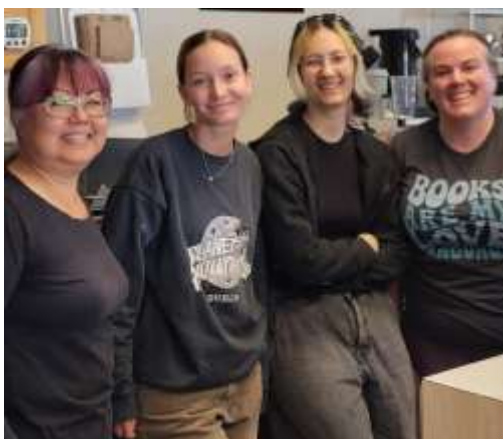
Java Garden's Team