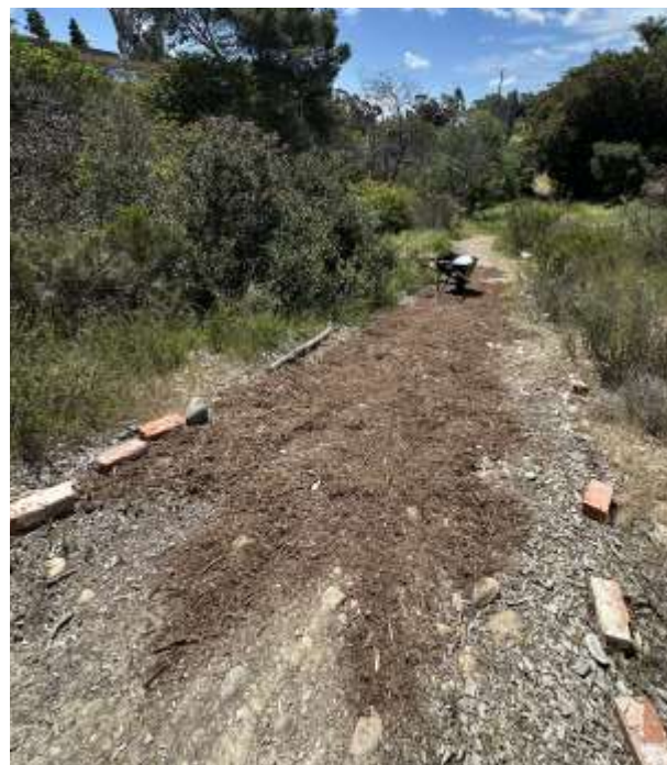
Friends of Ruffin Canyon Cleanup—Spreading Mulch on Path (see article on page 13)