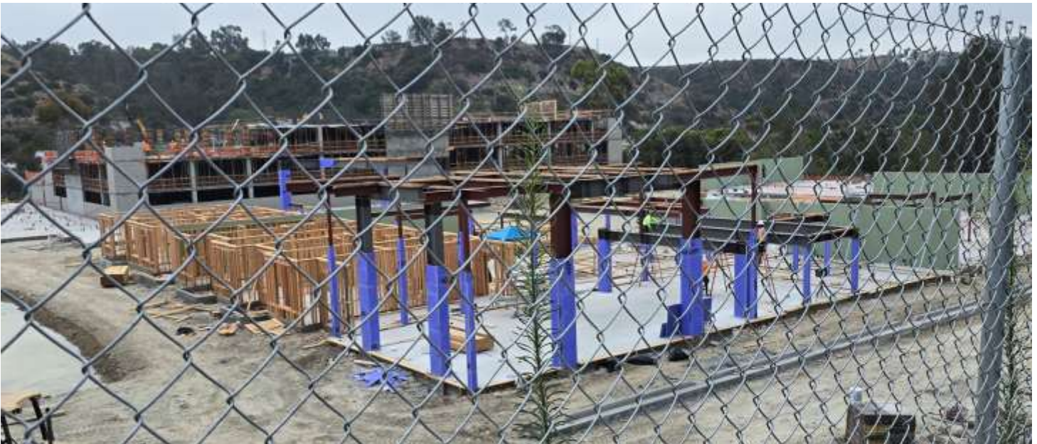
Photo of construction looking east.