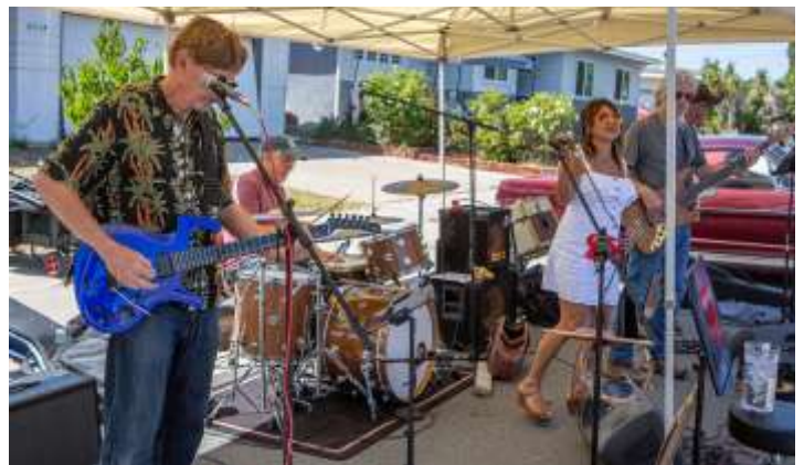
Siers Brother (right), Pinch Flats (top left), Love is a Rose (top right)