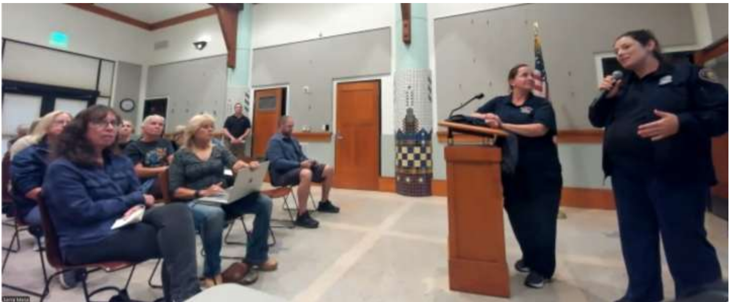
Zone Zero Presentation at May 26 Serra Mesa Community Council Meeting. Article on p. 6-7.

You are invited to participate in the next Serra Mesa Community Council General Meeting on Tuesday, September 29, 6:30pm, at Serra Mesa-Kearny Mesa Library